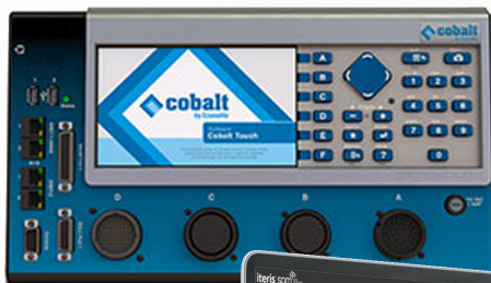
Econolite Cobalt Controller