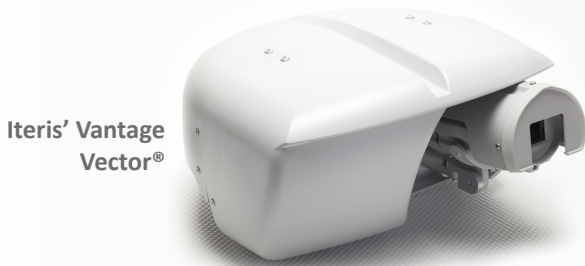
Iteris' Vantage Vector®

to reduce the severity and number of red-light running crashes – the ultimate goal being to eliminate them completely. iCASP is designed to effectively predict and then extend the “all-red” signal phase and delay the opposing green signal phase to avoid crashes.